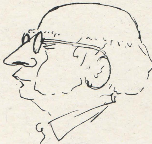
PREM KIRPAL'S Sketch by Peter USTINOV